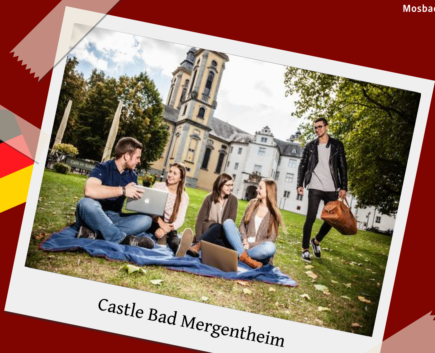
Castle Bad Mergentheim